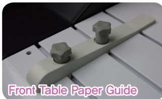
Front Table Paper Guide