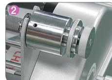
2 Patented film alignment system with clutch