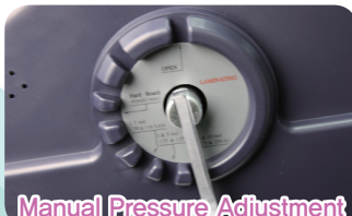
Manual Pressure Adjustment