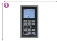
1 Operation control with LCD panel / with preset function