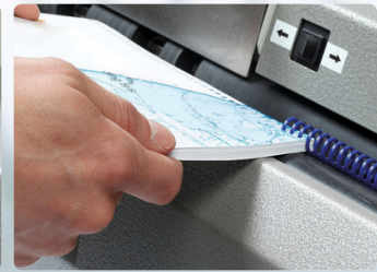
Dual spinning roller insertion for coil diameters up to 15 mm.