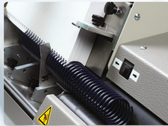
Book shaping spine formers enable the operator to insert diameters up to 50 mm.